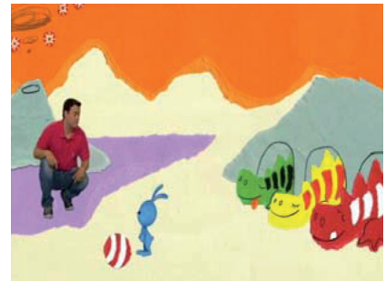
Figure 6: They looked for the egg’s mother.

Some international experts praised the program as they found it appropriate for the target audience. “It is so good at this age group to know that they don’t have to be screamed at or over-animated at – that playing has so many notes and tones: you can be calm, and silly and playful and joyful at the same time – and they agree. This was one of the things that I said while I was watching it. It was just so nice that it just kind of let them have space to enjoy and imagine themselves” (male expert, USA). They also felt that the program was successful in projecting the life of a child. “I thought it was very imaginative, very simple, and very much into the child’s experience: playing around with clothes and costumes and changing” (female expert, Israel).