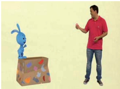
Figure 5: Kikaninchen and Christian found a dragon's egg.

person, but not a grown-up who is so smooth and pretends to be a child” (male expert, Norway).