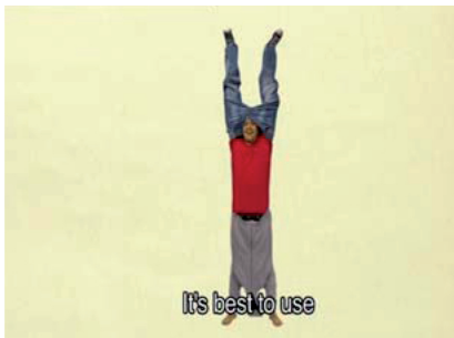
Figure 4: He learned how to use his clothes properly.