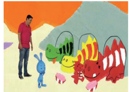
Figure 8: A little dragon was hatched out of the egg and it hugged its mother.

screenshots from Kikaninchen