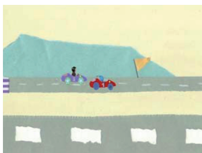
Figure 2: Kikaninchen was racing with another kid.

The international experts found the program to be lacking a central theme. "The whole thing was a bit random" (female expert, Japan). The female expert from UK also pointed to a similar aspect. "I kept on thinking: well, what is the point?" To this the female expert from Germany who was also one of the producers explained that Kikaninchen was not a show. " Kikaninchen is a kind of brand for the whole preschool part on KiKa. We got the order to create a brand. Kikaninchen is especially edited for the Prix Jeunesse."