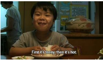
Ill. 4: A child recites the poem while eating rice at home

Japanese experts reflected this sentiment; “We [in Japan] really focus on design, especially for producing programs for kids.”