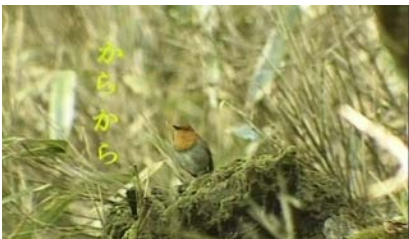
Ill. 7: A bird chirping a phrase from the episode