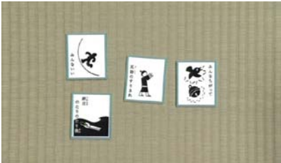
Ill. 5: A picture-matching game

“There’s such thought put into it, and so you do wonder why we can’t do that.” (female expert, Canada)