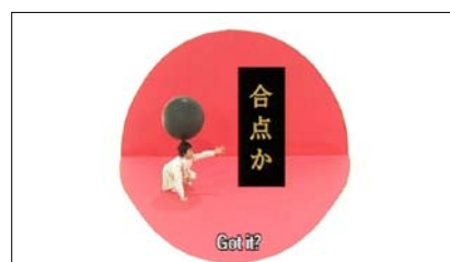
Ill. 3: The “Got It Dot”