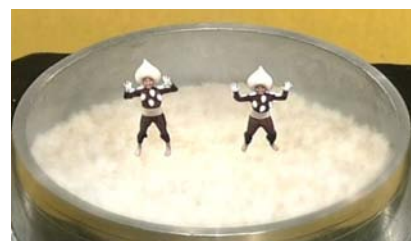
Ill. 1: Dancers dressed as grains of rice

“I thought Fun with Japanese was brilliant for its visual humor, and you heard the kids laughing.” (male expert, UK)