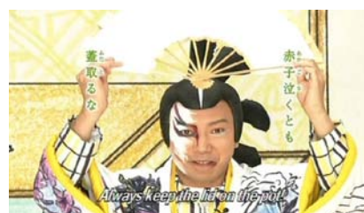
Ill. 2: A traditional Kabuki dance performance