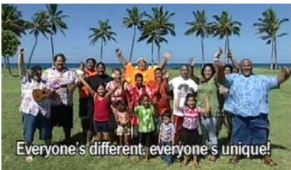
Ill. 6: A group of people on a tropical island recite Misuzu’s phrase