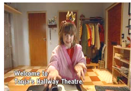
Figure 2: She decides to play the part of a princess.