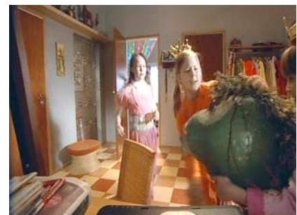
Figure 3: She needs to find a dragon but can not find a proper one.