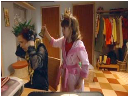
Figure 4: She asks her brother to play the part of the dragon, but he would not hear of that.