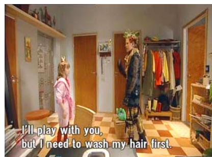
Figure 5: Tanja's brother and the lady go to the bathroom at the same time.

appearance and went out to do the thing. Then they came in and she found a dragon; she made it. She kept going back to the story. It was a little bit bizarre and a little bit hard to follow" (male expert, USA). They expressed a sense of missing information in the program. "Well, I like a little bit of craziness in children's films. But, sometimes I also like a little bit of guidance in the beginning. So, what is it about? I was all the time guessing. I didn't understand until the end: is the brother deaf too? Was he, or was he not?" (female expert, Germany).