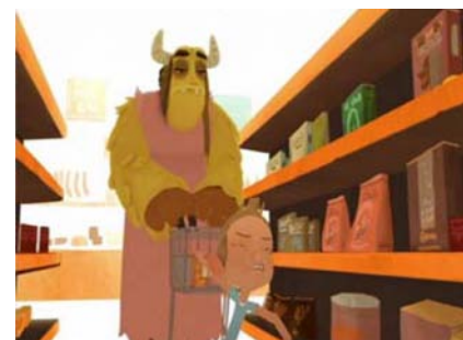
Figure 2: Haro had to take charge in the supermarket.