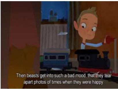
Figure 4: At night the beast mother was in the worst mood.