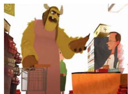
Figure 3: The beast mother was very abrasive.