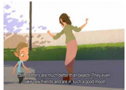
Figure 8: Finally mother is back to playing.