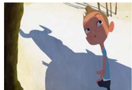
Figure 1: Haro's mother has turned into a beast after the divorce.

Some were confident that the program had a universal appeal and should not be restricted to dealing with divorce alone. "I thought it was so real. I think you can relate it to other issues: alcoholism, dysfunctionality, depression, and even things that are not bad things that cause a transition" (female expert, USA). However, there were concerns regarding the ability of a child to understand this program. "I think it is beautiful; I love it, and I was laughing. But, do you know if children actually understand this: that the mother turns into