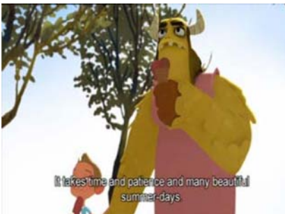
Figure 5: The beast mother needs time to cure her wound.