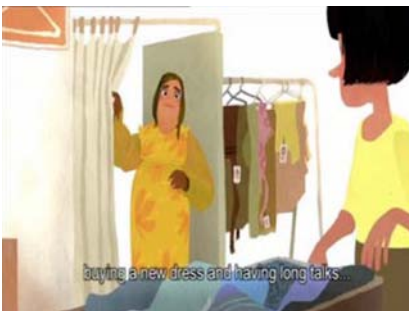
Figure 6: With time and friend mother was slowly turning back into herself.

a beast, because she is sad about her husband having left for a much younger woman or what?" (female expert, Denmark).