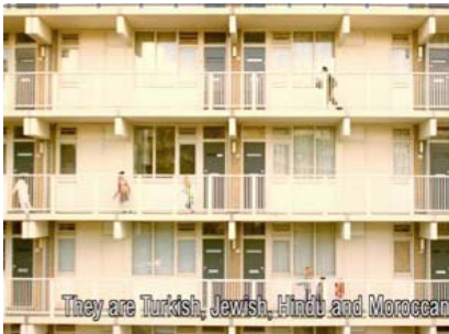
Figure 1: Abi lives in a multicultural building with friends coming from different cultural backgrounds.