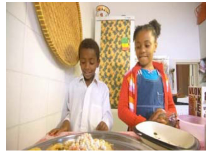
Figure 7: To make up for her fault, they make a new sort of Injera to serve the family.

However, some experts were not happy with the story. "I think the story was too constructed. It didn't do anything for me, and I think it won't do anything for children, because it is so constructed" (female expert, Denmark). "It is a bit constructed. I found it just very Dutch when I saw it" (male expert, Germany). A male expert from USA tried to explain this. "I had the advantage of having seen several episodes from the series. I think the idea is great. I don't think this is the best episode. I think it is funny at times, but not that strong."