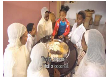
Figure 8: The family is surprised at the new Injera at first but they decide to enjoy it!

screenshots from Abi: Clean your plate