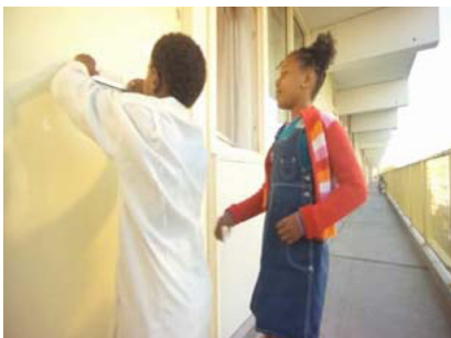
Figure 2: Abi decides to go to her friend's family to see how they pray.

The international experts had mixed opinions about the program. Some really liked the program and loved the character of Abi, the protagonist. "She was adorable. Abi was just one of these – I just really loved her, because she had a real sense of happiness about her. It was really nice to see all these gatherings – that every episode was about a different family that lived in her house that were having this experience with her. I just thought that she was really joyous. It was nice to see a really happy kid – besides all the other lovely stuff that went on" (female expert, Australia). "She was a very good actress" (female expert, Colombia).