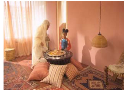
Figure 3: Her friend's family treat her with a feast, an Injera, and ask her to eat them all.

Some also liked the story of the program. "I liked the idea of the series – that this is a girl who lives in this big apartment block. There are people with all different kinds of backgrounds. There always is that kind of some misinterpretation and then learning later what is right" (male expert, USA). There were other observations as well: "I found that the treatment of kids is very different from Japan, because: Ok, she made a mistake, maybe giving food to the cat. But nobody scolded her for that. But in Japan, maybe the girl would have had to explain what she did exactly and find out what was right and wrong before she enjoys a meal with the family" (female expert, Japan).