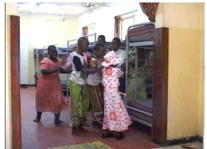
Figure 8: Welcomed by her friends in the boarding school.