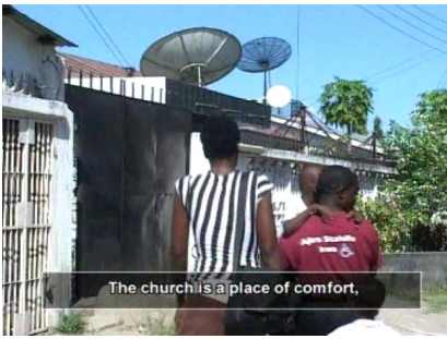
Figure 4: She has firm belief in the Church.