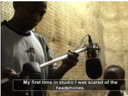
Figure 5: Her experiences when she first sang.