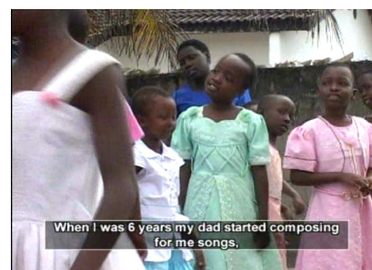
Figure 3: She has been singing since the age of 6.

Many international experts however were not convinced about the dream of the girl and thought that the so-called dreams were