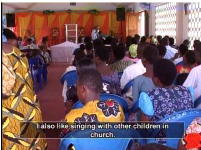
Figure 6: She liked singing in Church.

imposed upon her by her father. “I have a pretty strange feeling concerning this program. I thought that something is wrong, in a way. I am not sure why. I was not sure whether it is really her dream and not her father’s dream – writing songs for her, and more or less, forcing her to record them. When she said that she was afraid of the headphones, there were no more explanations about why she was afraid. I thought it was kind of weird, because for me it is not her dream; it is her parents’ dream. She seemed to me to be more or less instrumentalized by her family and by her church” (female expert, Germany). Some were also confused as they could not comprehend her real dream. “I wondered: what was the dream – singing for God, or being a lawyer?” (male expert, Chile). “Yes, I was missing the challenge. I didn’t know, because she was singing already, so what really was her dream?” (male expert, Germany).