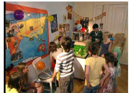
Figure 8: Kids enjoying the party.