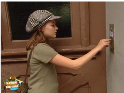
Figure 1: Katrin’s door bell is not ringing.