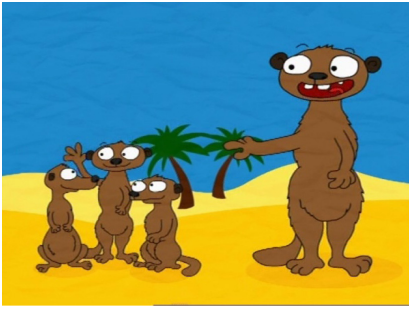
Figure 5: The program also has animated story about meerkats.

so what, the doorbell doesn't work! There was a sort of nice set of energy. There was a nice moment where she got friends to do it, but it was pretty: so what?" (male expert, UK). Some thought that the story was not focused: "If they only did that with the animals – they should have focused on the animals" (female expert, Turkey).