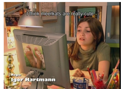
Figure 3: She is curious to know about meerkats

The international experts had mixed views of this program. They admired the story of animals but could not connect it with the partying in the home. “The bit about the animals was interesting – a little bit limp, but the other story – it felt out of the way” (female expert, Sweden). They were also disappointed with the character of the girl. “The girl didn’t come up with a solution herself. The man told her to do that – he told her. I thought: she should have at least come up with the solution herself” (female expert, UK). They could not understand the theme behind the program. “I thought it was a bit too contrived; the script was stretching just too far. I sort of felt somewhat: