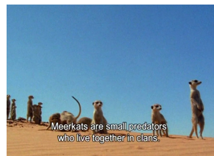
Figure 4: The program provides a lot of information about meerkats.