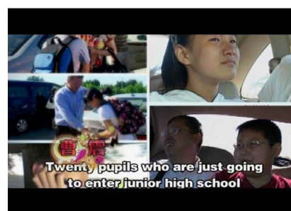
Figure 2: Parents bring their children to the camp.