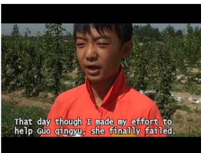
Figure 7: Many experts felt that the games were too harsh.

something bad happened with the boy? Death or something bad; it is a very big problem – to produce a show like that. It is a little bit risky” (female expert, Argentina).