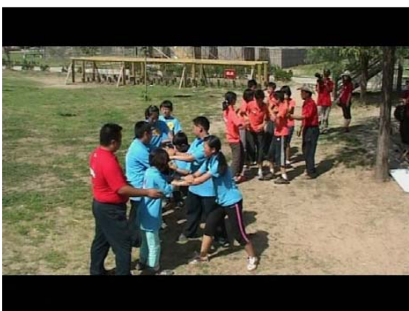
Figure 6: There were a lot of fights among the kids.