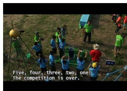
Figure 3: They were involved in lots of games.