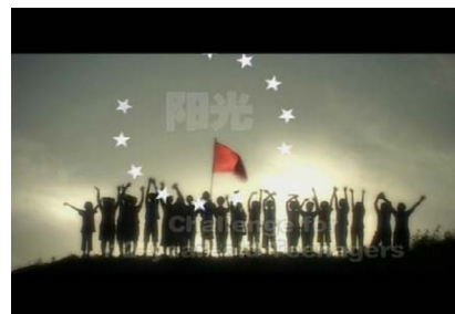
Figure 1: The group of children who live together for eight days

Almost all of the speaking participants could not understand the competition that was shown in the program. Many thought that the program was unnecessarily way too aggressive. "As the show was shown for half an hour, we felt that it was not necessary to show these people suffering like that. Playing the games was nice, but to see the people, the children, fighting each other and suffering for not winning the game was complicated. On the other side, I am sure that this show has a high rating. I think it is a contradiction, because you need the rating, but not this way" (female expert, Argentina). Some added that the competition was damaging. "It was a really unhealthy competition. I didn't understand it really: the mix of the group, and then they changed it" (female expert, USA). Some also thought that the program was unsafe. "I was thinking when I was seeing the show, that if I was the producer: what happened if