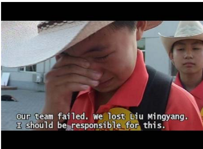
Figure 4: The games left many kids in tears.