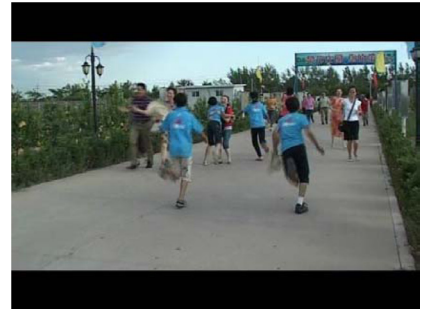
Figure 8: Ultimately the kids were united with their parents.