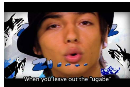
Figure 5: The anchor explaining the various sounds.