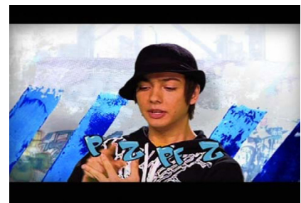
Figure 6: Vocal imitation of various sounds.