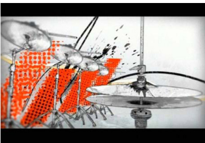
Figure 2: Various instruments in beatbox.