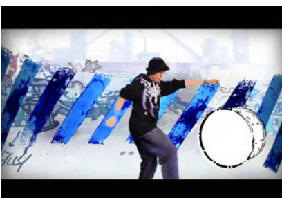
Figure 3: The drum in the beatbox.