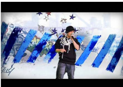
Figure 1: The anchor in beatbox.

One of the experts herself learned about the meaning of beatboxing after watching the program. "Now I know the fundamentals of beatbox. I was