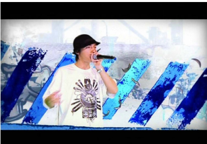
Figure 8: Another sound.

always wondering. I have tried, but – to no avail. Who is planning a career as beatbox – I don't know?" (female expert, Israel). They admired the fact that it was made for children. "I thought it wasn't the most impressive show that I have seen, but it was an absolutely perfect piece of children's television. The thing that struck me most about it was that it was totally respectful and got the fact that kids want to learn things" (male expert, UK).