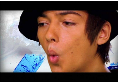
Figure 7: Many experts admired the program.