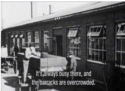
Figure 4: Archival footage was incorporated in the program.