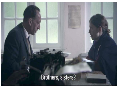
Figure 3: Information about Jews was recorded in detail.