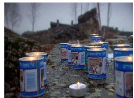
Figure 8: Memorial candles to the people who have been exterminated.