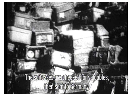
Figure 7: The belongings of Jews taken away from them.