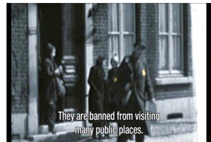
Figure 1: 13 at War is about the lives of Jews during the Nazi period.

The program had three different types of elements. There was the historical footage; there was the drama, and then there was the hostess. This juxtaposition of three genres was appreciated by the experts. "I think they always complete each other; it is one chain of information. There are different facts, factors, and scenery. That mix was very healthy. I think it would attract the kids more than a straightforward documentary with all the pictures. They don't like the straightforward news. But, in this one, I think the drama part of let's them feel the fact that some harm happened in a certain part of