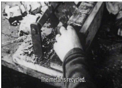
Figure 5: They were forced to do all sorts of work.