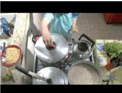
Figure 5: Lucas first tries to use garlic to dispel Victor away from Grazi.

The program dealt with problems that young children face worldwide. For example, it portrayed the problem of the family and how to live in a three generations family; it dealt with poverty and the differences between a brother and sister. When children reach the stage of puberty, they exhibit intense emotions. Some move away from the family and become individually oriented. This complexity of perspectives was expressed in the following discussion: "I think one of the many beautiful elements in this program is that at the same time we have seen two worlds: the world of the boy, and the world of the parent. Some of the other elements are hitting both sides of the story. All that led us to the climax and then we come to the resolution. You feel the story; you are having fun with the grandmother, with the son, with the boyfriend who is coming, and later on everybody together like a happy family. It is very nice for the kids. I am sure that they will enjoy the film like that" (female expert, Japan).