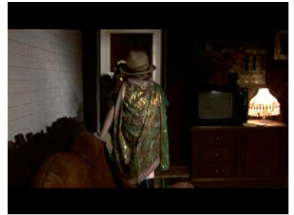
Figure 7: Lucas makes his final attempt to drive Victor away and stabs him.