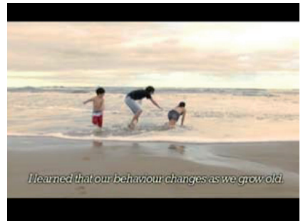
Figure 8: Grazi explains to Lucas about her relationship with Victor and they finally come to terms with each other.