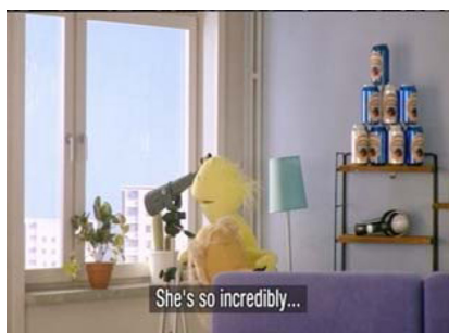
Figure 4: Two puppets fighting over a girl they saw through a telescope.