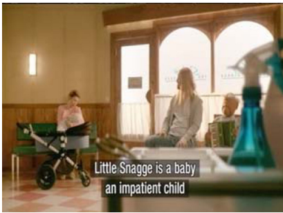
Figure 8: Everyone trying to calm a crying baby using music and love.

(male expert, USA). A male expert from Sweden who was one of the producers of the show elaborated. "I think the mixture of puppets is because it was quite a low budget show, so it used some of the puppets that are used in other productions for the last ten years."