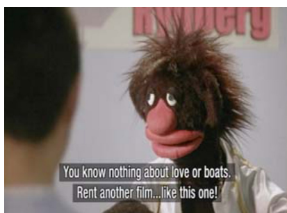
Figure 6: The puppet lecturing two teens when they asked to watch a romantic movie.