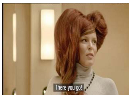
Figure 5: The girl getting a romantic hairstyle for her date in the evening.