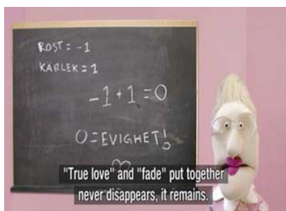
Figure 7: True love never fades.

band. But, I liked it, because he is a character you never see in kids shows – this dude” (female expert, Sweden).