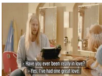
Figure 1: Talking about love in a hairdresser shop.

For all Ages was one of the PRIX JEUNESSE INTERNATIONAL 2010 finalists in the 7-11 Fiction category.