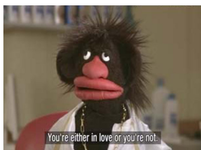
Figure 2: An African puppet speaking about unrequited love.