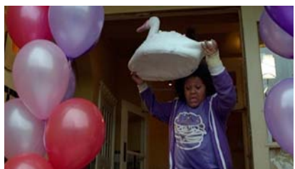
Ill. 8: Faris gets revenge when he runs out of the party with the swan cake topper

Many really appreciated the sincerity of the characters, and said that they showed substantial growth in a heartwarming way.