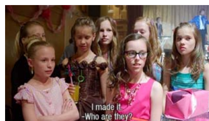
Ill. 2: Fee's friends tell her that they have found someone new to do the dance routine with them