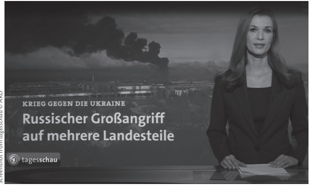
III. 1: 45% of the 181 participating adolescents (13-17) used television as a source of information (here: the German prime time news programme tagesschau , ARD)

The questioning on February 23 and 24, 2022 shows that all the adolescent respondents had heard about the conflict and a good 9 in 10 could name the participating parties and the direction of the aggression. Here, the adolescents' understanding of the situation ranged from a superficial naming of