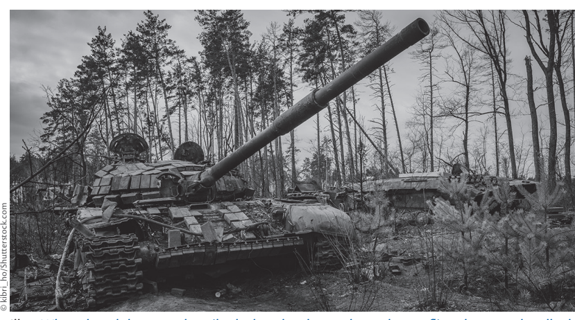
III. 3: When the adolescents described what they knew about the conflict, they mostly talked about fighting, in particular bombs and tanks

This time, the main source of information among participants was parents, at 82%. A good 4 in 10 cited teachers as a source of information, and a good 3 in 10 cited friends.