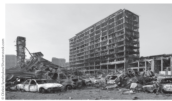
III. 4: Images that increased the adolescents' fears were those that showed warfare and what war leaves behind: destroyed cities

Overall, the study shows very clearly that adolescents want to be informed about the current situation in Ukraine, and that multiperspectivity and the veracity of the information are very important to them. They would like some reassurance that the war will end, but no one can offer this. What is possible, however, is for the media to provide