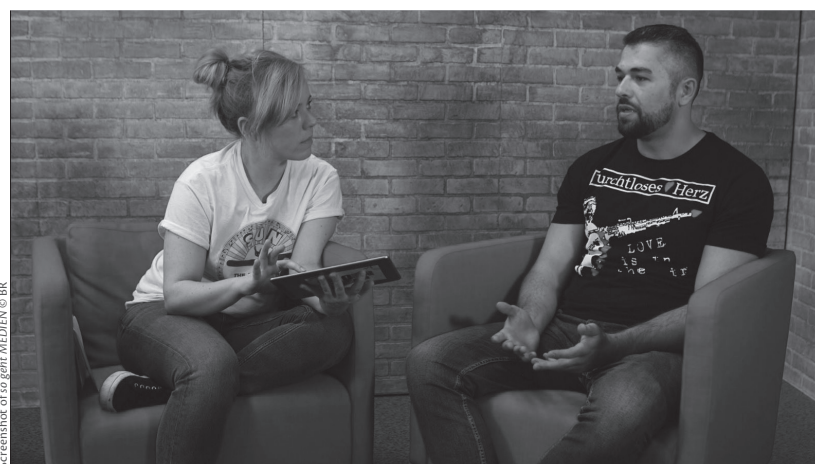
Ill. 3: In the explanatory video, a dropout from the Islamist scene (right) explains the extremists’ strategies to recruit new members and spread their ideology

85% of the pupils in the study indicated that they had learned something or taken something concrete away from the teaching unit, e.g. a 14-year-old girl