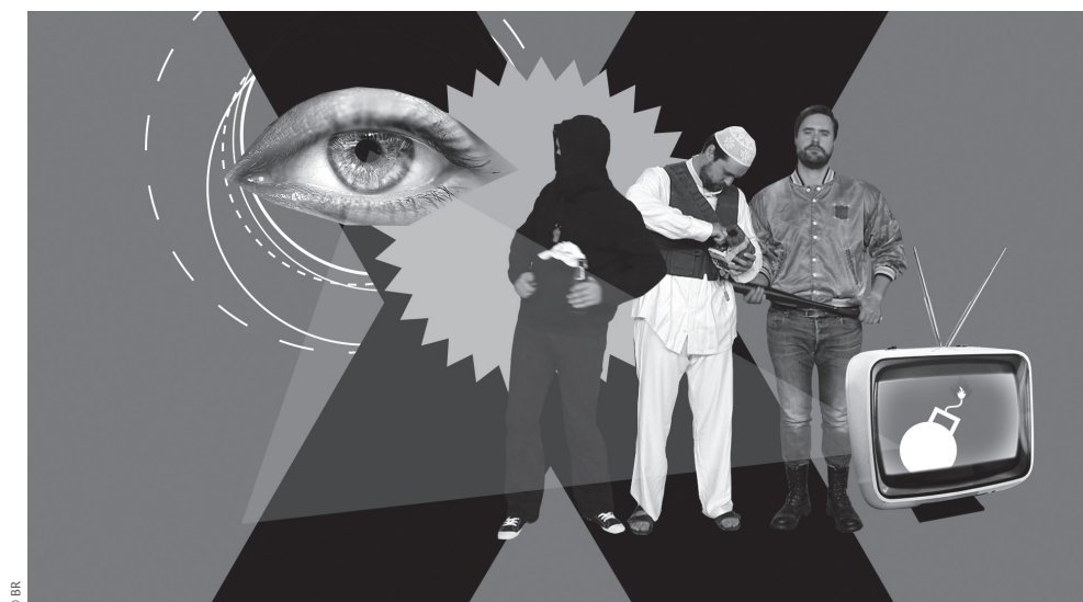
III. 1: The video on “Extremism and Social Media” helps pupils recognise different kinds of extremists and gives them tips on how to unmask extremist posts and videos

Right-wing extremist and Islamist actors try to