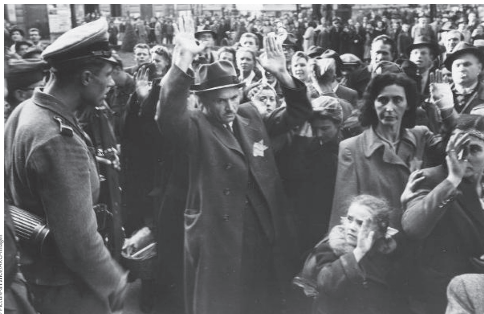
Ill. 3: Many German children and adolescents have a (superficial) knowledge of the persecution of Jews during the Second World War; there are major gaps in knowledge with respect to the persecution of Roma

A quarter of the 6- to 7-year-olds knew that Jews were persecuted during