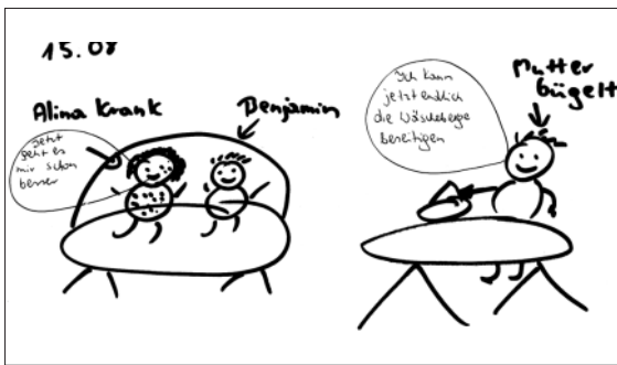
Ill. 2: The sick child is watching TV (child: "Now I'm feeling better!", mother: "Finally, I'm able to iron the laundry!")

rises to 84 %. Only 10 % of the parents with 4- to 5-year-olds claim never to use the television with this motivation. This function features more prominently when there are more siblings in the household. Sometimes parents use this gained time for professional responsibilities or for social networking, for instance in order to have undisturbed talks with their acquaintances. In some cases parents simply have a desire to unwind and to "have a break". Depending on the situation they are either in the same room with their child who is viewing television, or they are in a different room checking from time to time. It does occur, however, that parents leave their toddlers alone at home in front of the running television. In this case the television assumes, in everyday language use, the function of a babysitter.