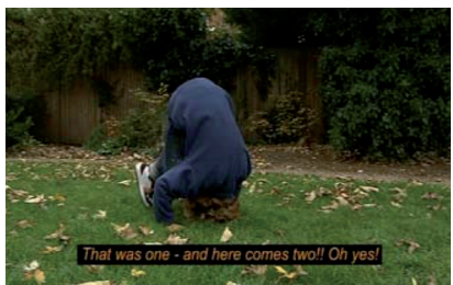
Figure 3: They first reported a boy who could make two rolls at a time.

Almost all international experts had positive things to say about the program. "I thought it was fabulous. It was really good" (female expert, USA). "I just loved that program. The three characters: the two on the set, and the reporter; it is fantastic. I loved the show" (female expert, Columbia). "I also really enjoyed it. I liked the concept, and I like the way it was presented" (female expert, Israel).