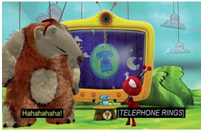
Figure 4: They got a call from Millie who could play piano with both hands.