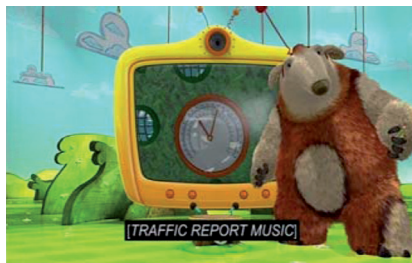
Figure 1: Antony presented What's Your News.