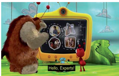
Figure 7: Experts gave suggestions on how to deal with mistakes.

The program was about kids making and telling their own news which really fascinated international experts. "I loved those elements at the end where you just have the children, and they are telling their news. For me, that is the beauty of the show: it is the children's news" (female expert, Wales). The female expert from UK who was also one of the producers of the program explained, "That was their news. We didn't change the news. We were really sticking with the news that children told us. What we would do with the main story is that sometimes we would add a problem. That was the other idea: babies can be experts. The whole idea that it doesn't have to be somebody that necessarily speaks."