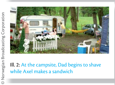
III. 2: At the campsite, Dad begins to shave while Axel makes a sandwich