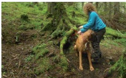
Figure 5: Selma finds a dog in the woods and decides to take him home.

expect for the older age groups and as adults – which you don't see very often" (female expert, Australia).