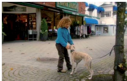
Figure 1: Selma loves dogs but her parents do not allow her to have one.

Many international experts loved the program and admired it for various aspects. “I think it was a good story and a good script and well made – also nice that it took time. It is like 26 minutes. I think it was a really good story for children” (male expert, Sweden). “I liked it; I thought it was a lovely story” (female expert, Australia). They liked the humour in the program. “I liked it very much: I could feel with her. I liked the humour in the story. Not all of the stories had humour that we have seen, but this one had” (female expert, Germany).