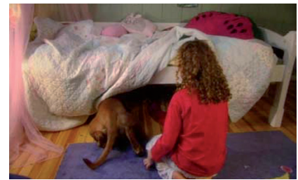
Figure 7: Selma hides the dog underneath her bed.