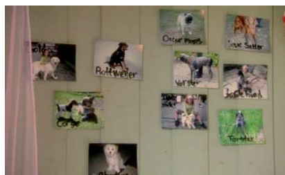
Figure 2: Selma hang pictures of dogs all over her bedroom wall.

However, some thought that the story was not too well done. “I like it very much, but I feel like it is constructed. The thing about the dog, and I didn’t quite get how she got the dog” (female expert, Denmark). Some found the story confusing. “Yeah, it was a kind of cliffhanger there in the end with the old lady” (male expert, Sweden). There were objections to the message of the story. “Even just going up to a strange dog – it is like you cannot really do that” (male expert, USA). “That is what I was going to say: you teach preschoolers not to go to strange animals” (female expert, USA).