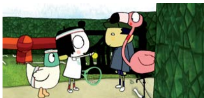
III. 6: John and Flamingo introduce themselves to Sarah and Duck