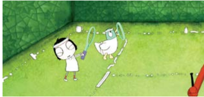
III. 5: Sarah serves the first ball over the net