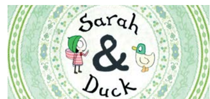
III. 1: Sarah and Duck are best friends

“Usually the narrator is the narrator. In this story the narrator obviously has some connection with the characters. I thought that was an interesting choice.” (male expert, Canada)