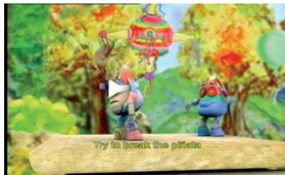
Figure 6: One blindfolds the other and asks him to break the pinata.

two characters in their looks but in their characters. “We didn’t want to make a big difference between them. But the difference is that one is more easy-going, and the other one is very hyperactive – wants to do everything fast. The other one is more chilled-out and enjoy – not everything is just going fast. The difference between them is more in the value of things, of doing stuff, and enjoying the play” (male expert, Chile).