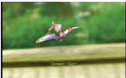
Figure 2: One drives very fast to one direction and enjoys the speed.