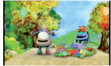
Figure 7: They quareled on how much candy from the pinata each should have.

The international experts loved the different speed of the characters. “I loved the story of quick and slow; fast and slow – I come from a country, which is very fast: Taiwan. The slow one I can appreciate, but the fast one: how can you enjoy when your speed is so high. I loved the story! Enjoy the speed or the scenery might be totally different – to show the diversity” (female expert, Taiwan). However some international experts found this concept of fast and slow confusing. “I felt the concepts – I think it was confusing, and I think that the concepts did not get across particularly well for young children. I think the concept of: one went to the right, one went to the left, and they were doing fast and slow: fast and slow are only fast and slow in respect to something else – a snail or a turtle is fast compared to a snail perhaps. But, we think of a turtle as being slow. I just don’t think that the concepts got across” (female expert, USA).