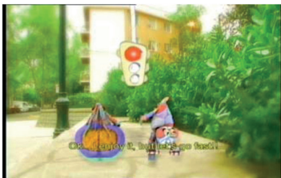
Figure 1: Two friends decide to compete over who gets first to the destination.