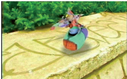
Figure 5: The two friends finally get to the destination at the same time.