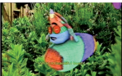
Figure 3: The other drives slowly to another direction and enjoys the beautiful scenery.

The international experts were impressed with the technique used by the producers which was quite innovative and effective. “I was impressed – having done CG and live action environments – just how well they had done that integration and that the camera was moving and hand-held in a multitude of shots of watching that was impressive. I think that to me it worked better when it was on a live action environment. There was the one: the very end when they were on the pedestal or something; it didn’t have the same energy as it did when they were actually out there. I thought that in itself was – I was shocked, like literally moving around and going up to the trees and stuff, and keeping those characters composited was impressive” (male expert, Canada). Some, however, had different ideas. “I think while the technique took over, you were focusing so much on technique, making new things that it took away all the content in the program” (female expert, Denmark).