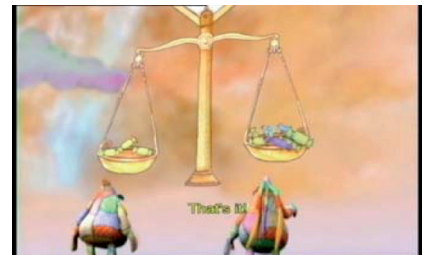
Figure 8: They finally used the scales to divide the candy evenly between them.