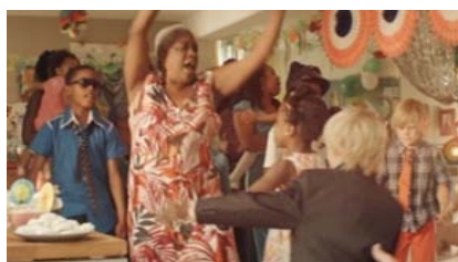
Ill. 8: Dancing with granny at the party

Some of the experts thought the humor in My Crazy Granny! was good and appropriate for this age group. “With humor for preschoolers,” one female expert from the UK said, “a lot of the humor maybe is just a feeling that they get. It’s one of the most important feelings they get,” and some of the live-action programs, of which My Crazy Granny! is a good example, she said, “got that really well”. In addition, one of the most memorable moments for some of the experts was a humorous segment in which one of Saäda’s friends, whose grandpa was shown earlier wearing a mismatched pair of socks, turns to her and says “your grandma is just like my granddad.” One of the experts thought this “just showed that kind of recognition between children”. (female expert, UK)