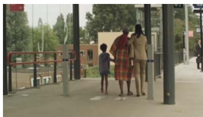
Ill. 6: Helping take care of granny