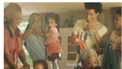
Ill. 2: Saäda's family