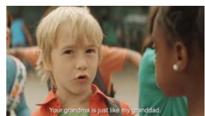
Ill. 4: “Your grandma is just like my granddad”