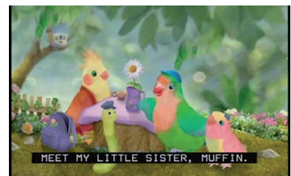
Figure 3: Muffin is startled when she sees that Elliot is NOT a bird.

The international experts liked the quality of the voices in the program. “Well you have got nice voices here. It has that kind of freshness, fruity freshness, in the voices.” (male expert, Germany). A male producer from the US explained the casting of the kids. “Every actor on that show with the exception of the kid that played Rudi were all first timers. We tend to like to cast first timers, because they don’t have a lot of preconcep-