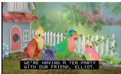
Figure 1: Samuel and Rudy invite little Muffin along for a tea party with their friend, Elliot.

Many international experts liked the concept of diversity in the program. “I think this episode is one of the best representations of diversity that we have seen” (female expert, USA). The male producer from the US explained, “I wanted to do a show that is community based, where all the problems are solved internally. If you watch the series of 3rd and Bird, they never get outside help. They have always got to solve it with the teacher, their friend, a worm, or somebody like that, but it is an internal way of resolving it.”