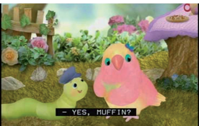
Figure 7: Muffin decides to give it a try and apologizes to Elliot for her rudeness.