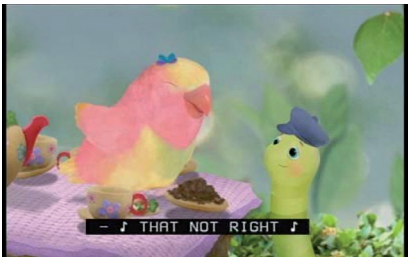
Figure 5: Muffin shouts at Elliot when she finds Elliot acts everything differently.