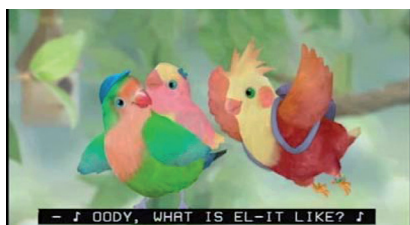
Figure 2: The birds are on their way to meet Elliot.

They also appreciated the fact that the program is full of innocent emotions of children. “I really think this is a beautiful program. It has all the good feelings” (female expert, Denmark).