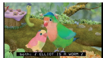
Figure 4: Muffin told her sister that she wanted to go because Elliot was a worm.