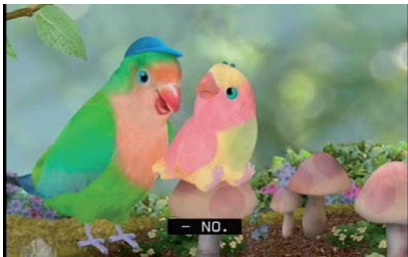
Figure 6: Her sister asks her to tolerate difference.