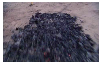
Figure 7: With faith, the boy walked on the embers.