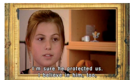
Figure 1: A girl from Chechnya with tremendous faith in God.

Some also liked the program because it was able to focus on a lot of philosophical topics. “I think that this program is very special, because it was made intentionally in a movie, and being in a movie it