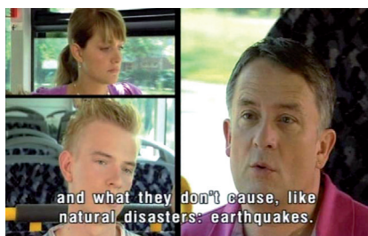
Figure 5: They went in a bus to find out about the existence of God.

is easier to prove this very difficult or philosophical problem. So, I think that the move itself helped a lot to catch the idea and to bring it over to the live audience. The aim of this program was not to give answers, but to bring the young person into the middle of the process. This enabled the visual form, which is very active. I think it is just innovative in the form and in the way that it approached the problems. I liked it very much. I am from Central Europe, where these kinds of programs haven't been discussed for many, many years. We are trying to do it again, and this was very inspiring for us. I was very glad to see it" (female expert, Slovakia).