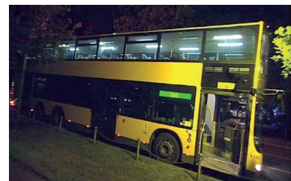
Figure 8: Road trip to discover God.

Screenshots from Next Stop ... God