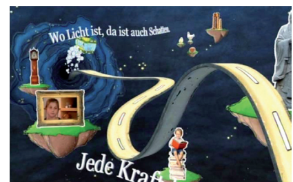
Figure 2: A journey to discover God.