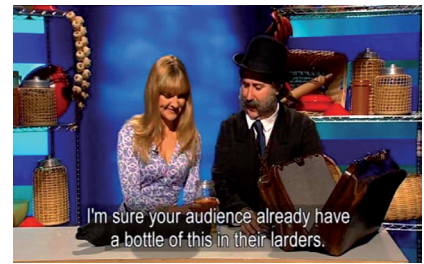
Figure 7: Eccentric Victorians.

However few international experts had different perspective. “I think in this case – too much information on the information parts. Because, if you have to read and to listen to this and all the pace at the same time, I think it is a little bit fast” (male expert, Germany).