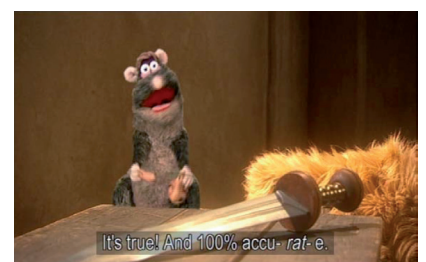
Figure 3: Experts appreciated the use of humor in the program.