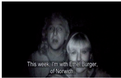
Figure 4: The program highlighted anecdotes from different eras in Europe.