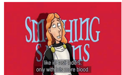
Figure 1: Horrible Histories .

There was an explanation about the books on which this program was based. “It is sort of the style of the books. It is based on these books, a series of books. That cartooning style, mixing things up, and mixing up facts is sort of what the books are like. It was about an adaptation. I like the books. I love the series. There are books, Horrible Histories , but it is pure comedy. It is by comedy writers and everything” (female expert, UK). They appreciated the humour depicted in the books and translated into the program. “They have captured the whole feeling of the books in this – very well, I think.