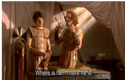
Figure 5: Alexander the Great.