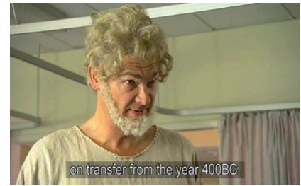
Figure 8: Dr. Hippocrates.