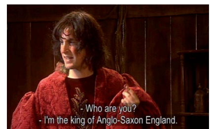
Figure 2: Horrible Histories is a series of short historical stories.