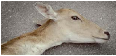
Ill. 3: Torben accidentally hits a deer with the car