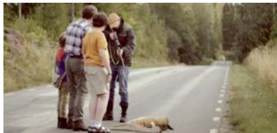
Ill. 4: A hunter prepares to shoot the injured deer