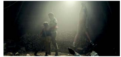
Ill. 6: Sune and Torben defeat the bank robber

“It’s the transformation of both, to find a meeting point of personalities and pending issues – it was very universal and interesting to me.” (female expert, Argentina)