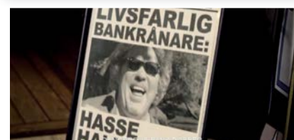
Ill. 2: Sune sees a notice about a dangerous criminal

Screenshots from The Survival Trip