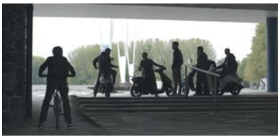
III. 4: The gang of boys meets up