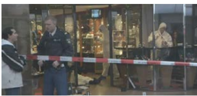
III. 6: Mimoun witnesses a body at the crime scene at the jewelry shop

"Really impressed. His dilemma was very complex and very clear at the same time. The show was very professional." (male expert, Norway)