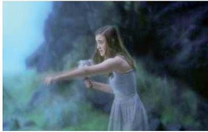
Figure 3: Shelly shows Meredith the way to escape.