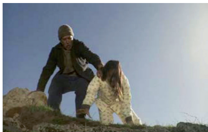
Figure 4: Lee Kaa saves Meredith from a cliff.