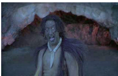
Figure 1: The Cannibal chief is shouting at Meredith.

Almost all of the international experts appreciated the program. They liked different aspects of it. Some found the mystery in the program interesting (female expert, Slovenia) while others appreciated the production value (female expert, USA). “I liked the Kaitangata Twitch . The production values were so high, and it was so obviously the rich middle of the story that it just seemed really unusual to have that strong kind of fantasy narrative and that realistic fantasy narrative for kids. Some of the special effects were amazing with the cave that turned into a mouth, with the big teeth thing, and I thought it was really great” (male expert, Canada).