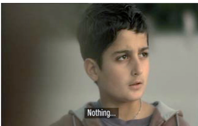
Figure 1: Habib tries to clear a misunderstanding between him and Paris, the girl who he loves.

Almost all the international experts liked the program a lot, and for various reasons. One of the many reasons was that they found the program funny. "I thought it was really funny. It surprised me, and I loved how the whole vampire thing seemed so real to him" (female expert, USA).