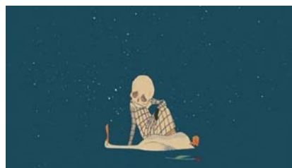
Ill. 6: An endearing scene between Duck and Death

One of the most memorable qualities about the film, albeit disturbing to some, was the brazen characterization of Death – a walking, breathing, talking skeleton. This idiosyncratic style did not sit well with others. In particular, they were concerned with the context in which the film was presented.