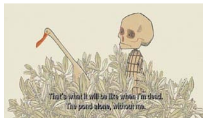
Ill. 3: Duck talks about death