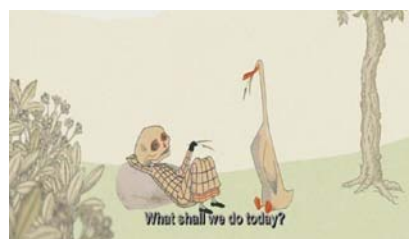
Ill. 2: Duck and Death strike a friendship