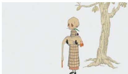
Ill. 5: Duck passes on

“I don’t really think it is for kids. I think it’s made for us as adults...it could be offensive to any family from any religious background, or to any parent that just wants to explain to their kids that there’s another life, afterlife or whatever. It was just very cynical.” (female expert, Chile)