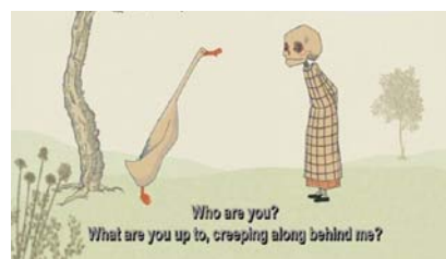
Ill. 1: Duck meets Death for the first time

“I liked seeing it, but I wonder if children related to it?” (male expert, Canada)