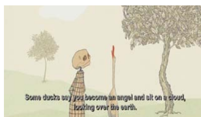
Ill. 4: Duck muses about the afterlife