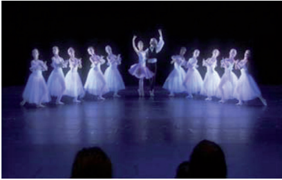
Figure 4: The beautiful ballet dancing wins warm applause from the audience.