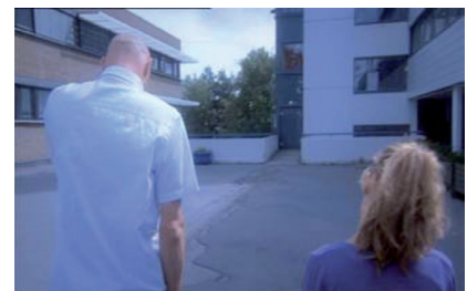
Figure 1: Lisa's ballet teacher is very angry at her when he learnt she wants to do hip-hop.

Many experts liked the issues children relevant raised in the program. "What I did think would be appealing is the sort of Soap Opera quality of it for this age group. I thought that was really well targeted, and I thought the issues were well targeted. I just didn't think that they were presented as well, as authentically as they could be" (female expert, USA). Some appreciated the issue of self-esteem in spite of being poor that was shown in the program. "Even more beautiful – she is not fighting for her because she is Muslim, but because they are coming from a poor area, and it is a special project of ballet, so that they could show that even if you are coming from this part of the town, which is known as not the good part, you can still do something. This is great, and it is because you are a girl and you are coming from this area, and show the world that you can