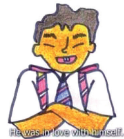
Figure 1: Rohan, the protagonist.

The experts also appreciated the fact that a very natural process of a young boy's experience with his growing moustache was presented in a very simple and natural manner. "I think this also shows that if you have a beautiful idea, some young people who are really eager for this product, and one camera, then it is very different. It hasn't cost a lot, and I think it is very beautiful" (female expert, Denmark). "It is a good program for 13 and 14 – not only in India, but also in Columbia. I like the resolution a lot" (female expert, Columbia).