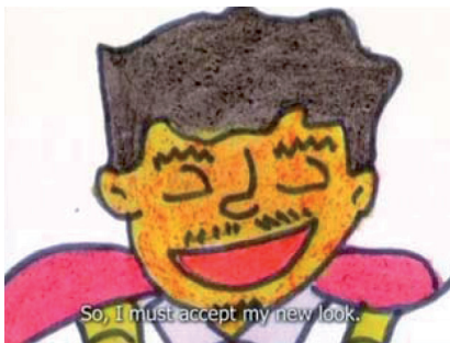
Figure 6: Finally, Rohan accepted his new look.