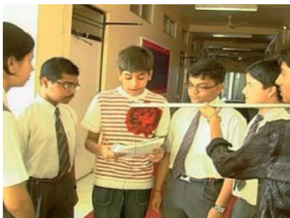
Figure 5: Children involved in the production of the show.