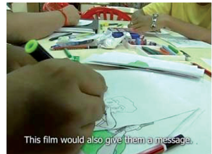
Figure 7: Team work behind the production.

The youth jury members from Venezuela had a mixed view of the program. Some took the process of change during puberty as something very natural and could not understand the fuss about it. “It is more or less not very interesting. Well, because during puberty one undergoes such a change, but there are people who start shaving but no one gives it attention” (female). However, there were others who could understand the behavior as shown in the program. “I really felt it was a very good video because it shows that the conversation with parents or someone else can help make them better people, and that it is totally normal” (male).