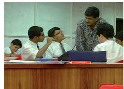
Figure 2: Children conducting workshops.