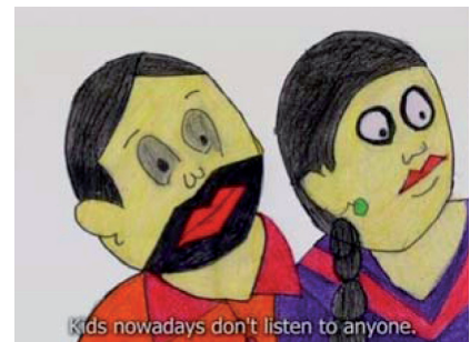
Figure 8: Parents can help the children during adolescence.

Screenshots from Rohan's Moustache