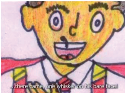
Figure 4: Rohan's growing moustache.