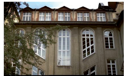
Figure 1: The school where the action takes place.

The international experts liked the plot as it was interesting and fast: "I like the story, because you don't know what is happening really, but you know that there are the bad guys and the good guys" (male expert, Norway). Many international experts liked the editing of the program. "It was fantastic; I really liked that. The pacing is really superb. It's all public, I think, because I mean, the room was, yes, all audience, the room was perfect" (female expert, Malaysia). Some international experts thought that the program was very suitable for the age group and children would enjoy watching it: "I think it is suitable for that age group. It is fast paced, and it keeps you glued to your set" (female expert, Ghana). The program ended half-way through the narrative – which left many experts in anticipation of the next sequence: "We have to watch the next episodes – that will go on DVD" (male expert, Pakistan). The producer of the program Alone Against Time was present and he explained that the whole story was thirteen hours long and had another 12 episodes to go, something that was apparently not very clear to some of the viewers who were disappointed at not reaching "the end."