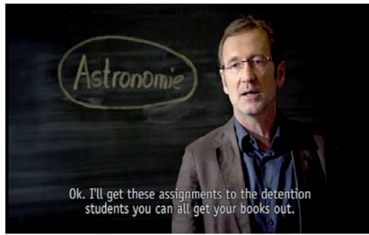
Figure 3: The professor in astronomy class.