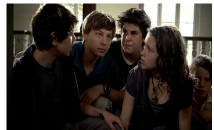
Figure 2: The five heroes of the program.