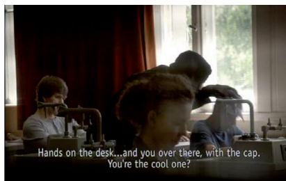
Figure 6: The students are taken hostage by the thugs.

All the members of the international youth jury from Georgia liked the program. They liked the program for its plot, characters, high production, and structure. “It was the best movie of all, top quality, and the plot was good” (male). The program invoked a sense of anticipation because of its story. “I was always waiting for something more to happen” (female).