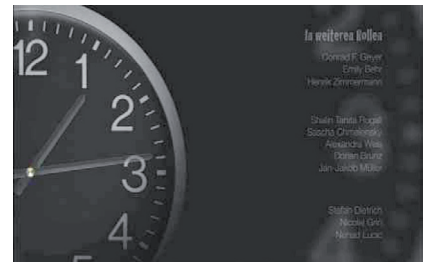
Figure 8: The program is liked because of its high action drama.

Screenshots from Alone Against Time