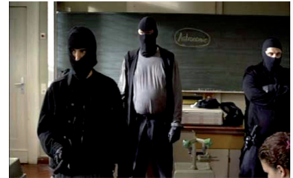
Figure 7: The gang in the class.

The international youth jury from Venezuela liked the program for its technical aspects: “The video is well done, has good graphics” (male). Some were not too happy with the end as they thought that it was not specific and found the subject to be too conventional. “Well, I found that it was conventional, because it is a subject covered in many films, and it leaves no room for my education” (male).